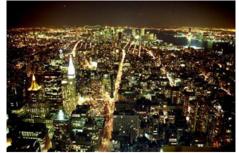
The lights of Manhattan by night without blackout.

In August 2003 the lights went out once more. Not only in New York, but also in other big US and Canadian cities.